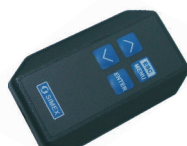
IR programmer SIR-15