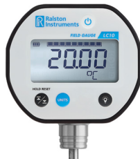
Field Gauge LC10-TA Digital Probe Thermometer