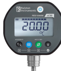
Field Gauge LC20-TA Digital Probe Thermometer