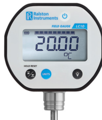
Field Gauge LC10-TA Digital Probe Thermometer