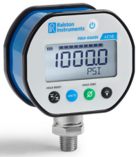
Field Gauge LC10