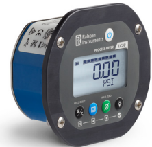
Panel Mounted Field Gauge LC30

Ralston Instruments provides complete pressure calibration solutions for a wide range of applications, saving time and taking the guesswork out of critical pressure testing, maintenance and repair operations.