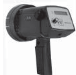
Nova-Strobe Vibration Strobe Series