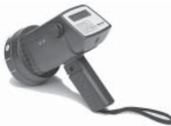
Nova-Strobe Digital Series