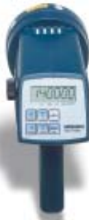
Nova-Strobe Phaser Strobe Series