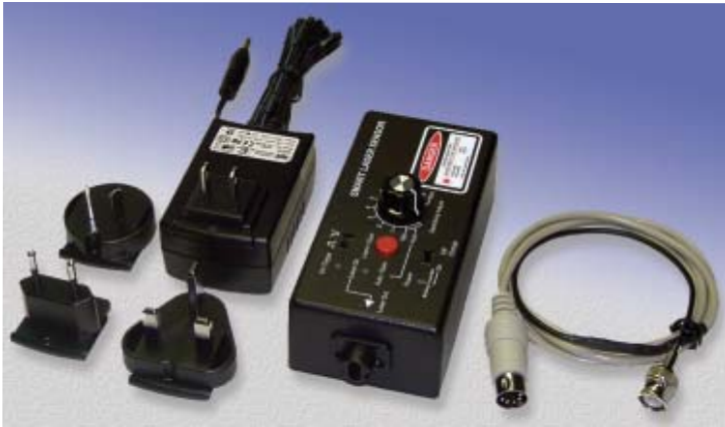
Smart Laser Sensor with 115/230 VAC PR Universal recharger, SLS-CA-BNC cable and 12 inches of reflective tape