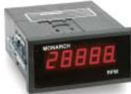
ACT Panel Tachometer Series