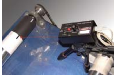
Tripod mounted SLS can provide TTL pulses from contrasting color targets.