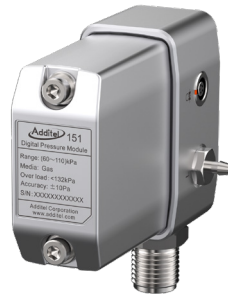
BP Pressure Module with Calibration Fixture