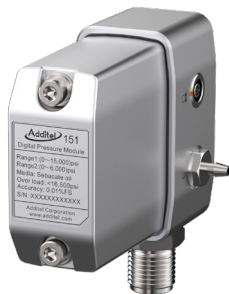
GP Pressure Module with Calibration Fixture

[1] A barometric pressure module is optional for ADT773/ADT783/ADT793. After inserting the barometric pressure module, the controller can be toggled to and from gauge and absolute pressure units.