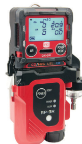
Clip-On Sampling Pump RP-3R