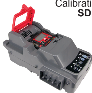
Calibration Station SDM-3R