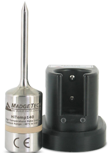
IFC400 (sold separately)

Using the MadgeTech Software, starting, stopping and downloading the HiTemp140 is simple and easy. To use, simply place the HiTemp140 in the IFC400 or IFC406 docking station (sold separately). Using the software, an immediate or delay start can be chosen, as well as the reading rate. Start the data logger, remove it from the docking station and the device is ready to be deployed. Graphical, tabular and summary data is provided for analysis and data can be viewed in °C, °F, K or °R. The data can also be automatically exported to Excel® for further calculations.