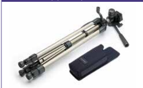
Tripod adapter, tripod, calibration certificate, belt pouch.